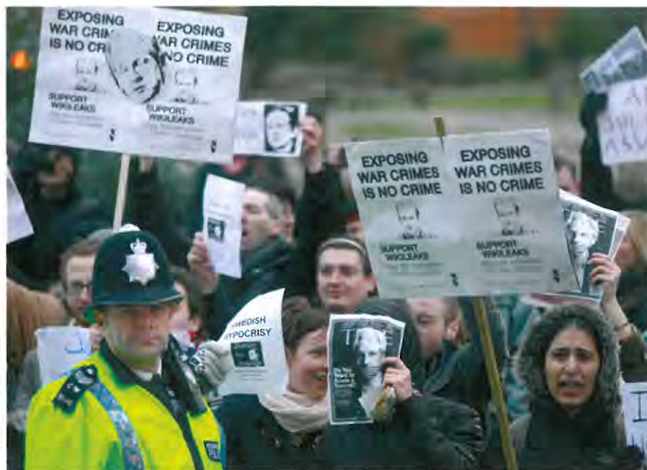
Supporters of WikiLeaks founder Julian Assange cheer outside Westminster Magistrates Court in London after he was given bail on December 14, 2010. Assange, wanted in Sweden for alleged sex crimes, is the target of U.S. fury over the release of secret diplomatic cables.

Assange is a tempting prosecutorial target for both practical and legal reasons. Practically, it is easier to prosecute a colorful but disagreeable character like Assange than the editor of The New York Times . Legally, the Espionage Act has been interpreted to require prosecutors to prove that a person intended to harm the United States. Abrams told NPR in a recent interview that because of Assange's comments about the United States, he had "gone a long way down the road of talking himself into a possible violation